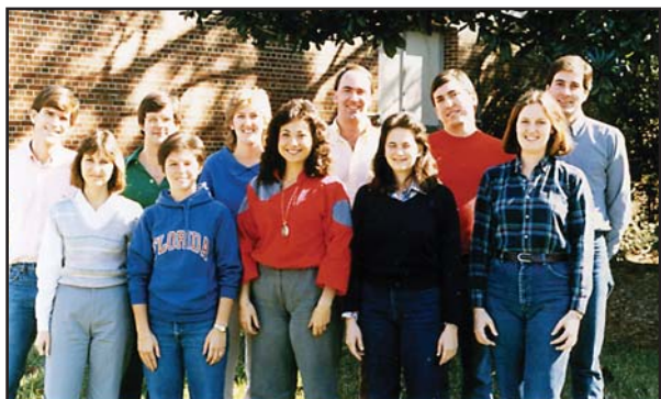
Class of 1986

We are inviting program alumni, former faculty, and friends to celebrate with us in Gainesville. In addition to the 40 th anniversary, we will be honoring the classes of 1966, 1976, 1986, and 1996. Please join us to reconnect with classmates, meet other alumni, and visit with program faculty and students. We will also be having a full day of educational sessions on Friday. We join the College of Public Health and Health Professions Alumni Weekend events on Saturday (Pre-game Barbecue and UF vs. UCF Football Game).