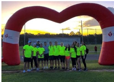
Fall Kickoff hosted at Lake Wauberg.