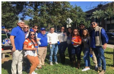
UF MHA Alumni Football Tailgate

This year, HASA has worked hard to bridge the gap between students and alumni. With events, such as the football tailgates, socials and Instagram takeovers, the organization helped foster a better sense of community. Habitat for Humanity, heart walks and food drives are just a few of the volunteering events that sprinkled the school year. New to this year were the Fall Kickoff, which integrated the new students with current students and HASA's first informational webinar.